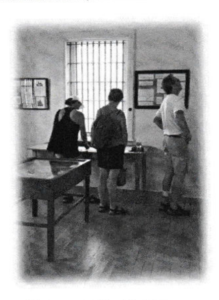
Visitors at the Lighthouse

Over 300 visitors toured the Bluff Point Lighthouse this summer. ation, more visitors will come to visit the lighthouse, the county