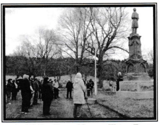
April 26th - Town of Saranac History Tour