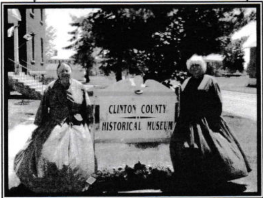
June 4th - Preparing for Cumberland Head Class Visit