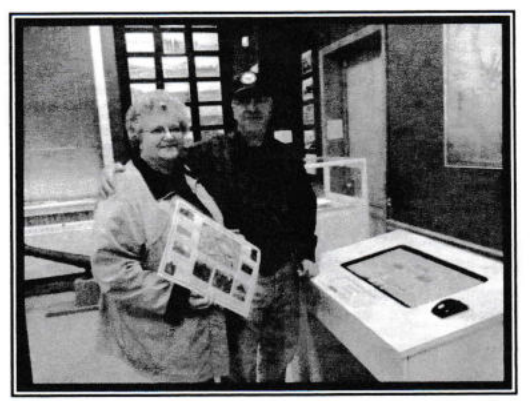
April 25th - Digital Exhibit Openings