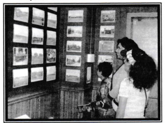
June 6 & 7th - Museum Days Weekend