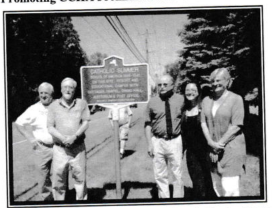
August 23rd - Catholic Summer School Historic Marker Ceremony

Promoting CCHA Premium Photo Collection Sales