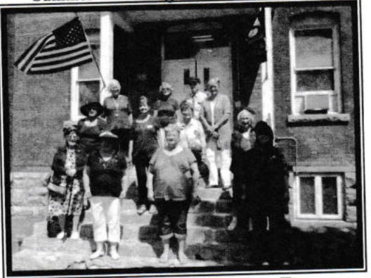
August 19th - Altona Red Hatters Tour