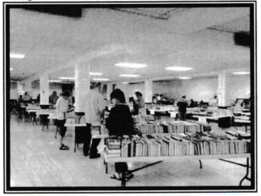
May 9th -Art and Book Fair Fundraiser

April 28th - Historian's Meeting at CCHA