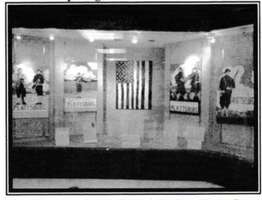
July - Plattsburgh Idea Exhibit in C.C. Gov't Center