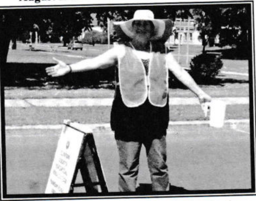
August 22nd - Streetdrive Fundraiser!