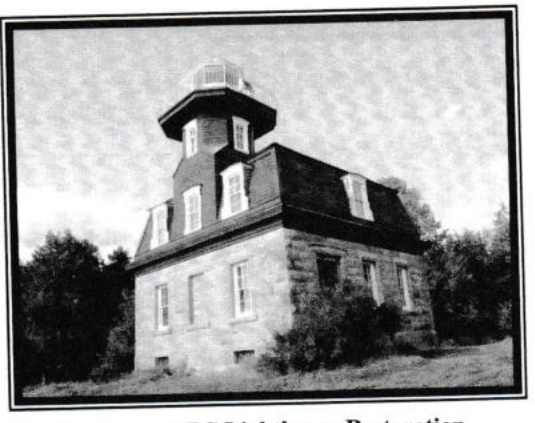
Summer - DEC Lighthouse Restoration