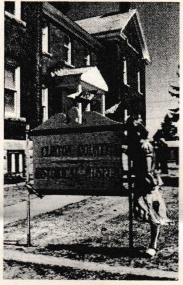
Lindsey LaMarche Great weather and smiles for our Opening Day Ceremony, April 19, 2007.