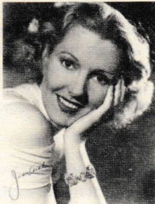
Jean Arthur Publicity Photo Mid-1930s

Between her birth in Plattsburgh on October 17, 1900 and her death in Carmel, California on June 19, 1991, Jean Arthur squeezed in a 50 year acting career that began as perhaps the most idealistic of America's Sweethearts – a tradition Mary Pickford began and that continues today with Jennifer Lawrence – and ended with her transformation into a truly unique, let us say eccentric, performer in television, the theater and the university classroom. At her peak from 1935 to 1945, she was extremely popular, well-paid, and kept her studio, Co-