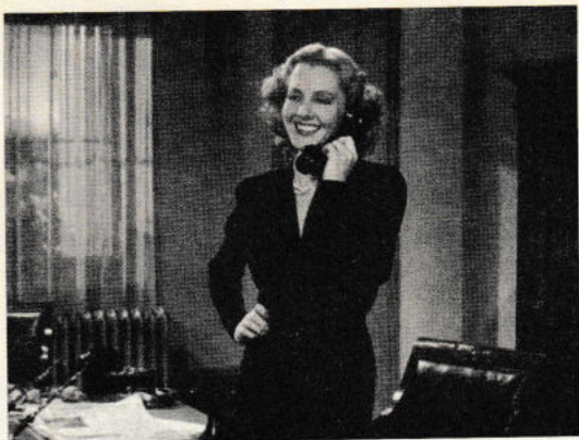
Jean Arthur in Mr. Smith Goes to Washington 1939

studio, she signed a contract with Paramount Pictures, and she and her mother moved to Hollywood. It was then that Gladys decided the time had come to give herself a performing name and she invented Jean Arthur to honor two heroes: Jeanne d'Arc (Joan of Arc), the savior of France, and England's King Arthur. The new Jean Arthur felt that her life would be heroic, and so it was.