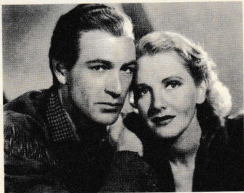
Gary Cooper and Jean Arthur, Plainsmen 1936

It took thirteen years to learn her craft and become a star. When the talkies arrived in 1927, audiences discovered her distinctive husky voice, compared to "a thousand tinkling bells" by her most astute director, Frank Capra. By 1930, however, she was too old for ingénue roles and decided her big chance for success