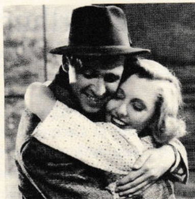
Jean Arthur in You Can't Take It With You 1938

and in 1934 signed with Columbia. Her performance in John Ford's comedy The Whole Town's Talking caught the attention of Capra who cast her in her breakout role as journalist Babe Bennett in Mr. Deeds Goes to Town .