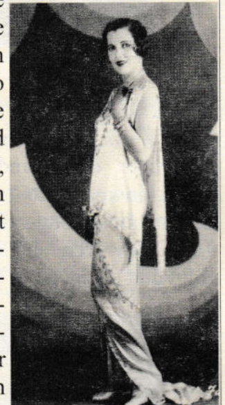
Jean Arthur Fashion Photo 1920's