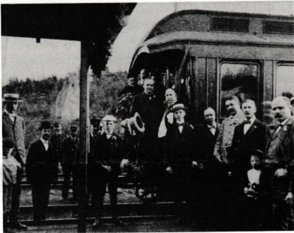
McKinley and Entourage, 1897

Even when a story can't be proven, it sometimes persists as myth. Such appears to be the case in a few instances that I examined.