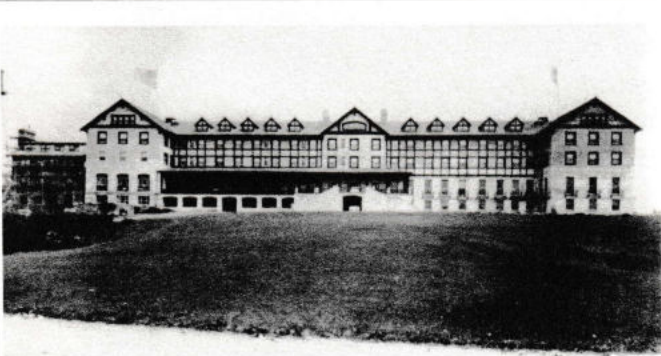
Rebuilding of Hotel Champlain After the 1910 Fire

Many of the top golfers of the era did come to play the course, including such notables as Walter Hagen and Gene Sarazen. Patty Berg was among the women's champions who gave exhibitions. Craig Wood played at Hotel Champlain while he was reigning U.S. Open champ. Perhaps the most famous golfer to tee off on the course wasn't a professional in that sport, but in another—the legendary baseball player Babe Ruth.