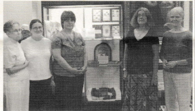
Above: Members of the Daughters of the American Revolution, Saranac Chapter, viewing Civil War objects they currently have on exhibit at CCHA. Below: CCHA Members and Friends from Lake Forest Senior Living Community enjoy an afternoon of touring and tea at the museum.