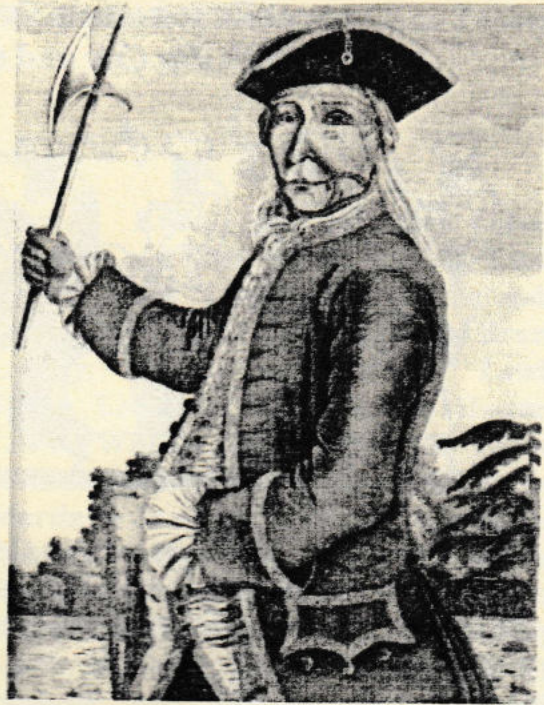
The brave old Hendrick, the great Sachem or Chief of the Mohawk Indians

The venerable Hendrick, spokesman for the more than 200 Iroquois in attendance, denounced both the French and the British for their encroachments on Indian lands. Hendrick realized that the survival of his people was not possible without the support of one of the two European powers, and his solution to the dilemma was to side with Britain, although he deplored that country's reluctance to act against the French.