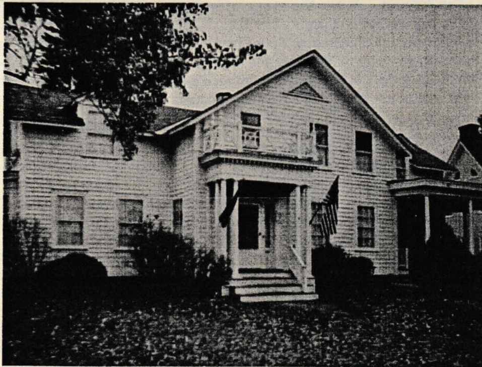
The Saily Warren House, 3 Cumberland Avenue, Plattsburgh