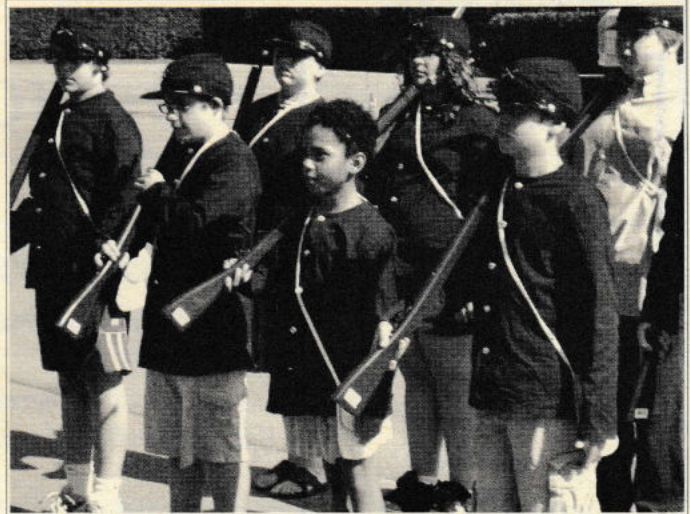
2010 Campers Drilling in Uniform with Replica Weapons at CCHA

experience the process of becoming a soldier by enlisting in the Union Army and filling out the appropriate paperwork. After receiving their uniforms and training rifles, they will learn how to drill according to the basic manual of arms, undergo in-